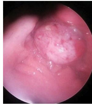
Figure 2 Fleshy vascularized tumor on the floor of the FNI.

We report the case of male patient of 15 years old from a rural community in the department of Choluteca, Honduras; with a history of nasal obstruction left of 2 months evolution associated with occasional episodes of epistaxis, referred to the otolaryngology service of Hospital Universitario School located in the city of Tegucigalpa, the capital. Physical examination mass is evident in upper inner eye rim moves the right eyeball downward and laterally producing ptosis ( Figure 1 ), the previous rinoscopia whitish mass hyaline smooth appearance is observed, vascular at the left middle meatus occluding 100% of the light from the left nostril (FNI) without epistaxis. Nasofiberoptic evaluation is performed (NFL) denoting fleshy vascularized tumor on the floor of the FNI, septum with deviation to the right, right nostril and free larynx ( Figure 2 ); the rest of the physical examination was normal. Sinus CT scan reports osteolytic lesion of FNI, nasopharynx and pterygopalatine fossa ( Figure 3 ). Angio MRI determines space-occupying lesion that compromises the left